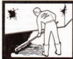
Tar, Asphalt, Sealcoat