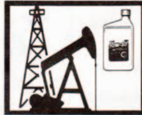
Oils, Grease, Fluids

MATERIAL CAUTIONS - Test for compatibility, especially on paint, plastic and stone. SSC 141 is generally safe to use on unstressed acrylic (Plexiglas), polyethylene, PVC, ABS and other thermosetting plastics and fiber glass (including gelcoat). SSC 141 will cloud polycarbonate (Lexan) and dissolve polystyrene. If SSC 141 spills on asphalt pavement or vegetation, rinse promptly with water.