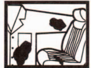
Clothes & Upholstery